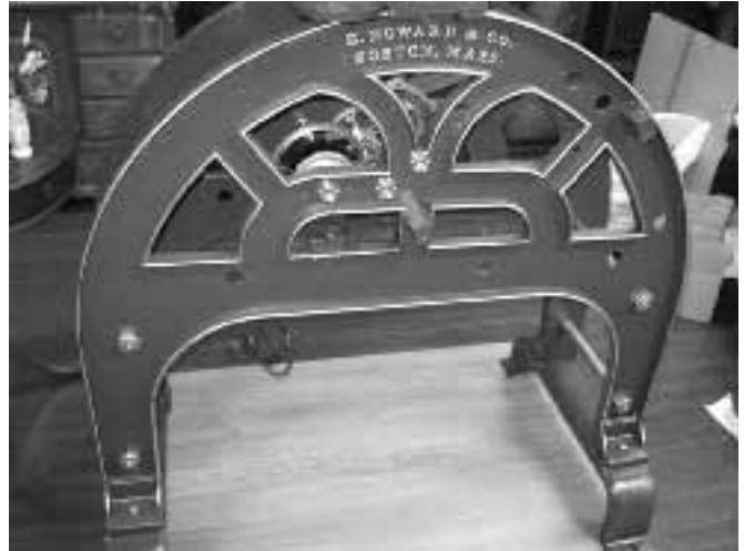
Picture of the clock works after renovation.