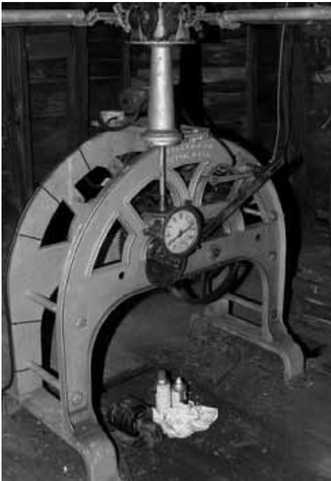
Before picture of the clock works at the Old Courthouse